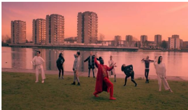
Kwaye music video Cool Kids , May 2017

Reinvesting our film income into community projects delivered by local residents