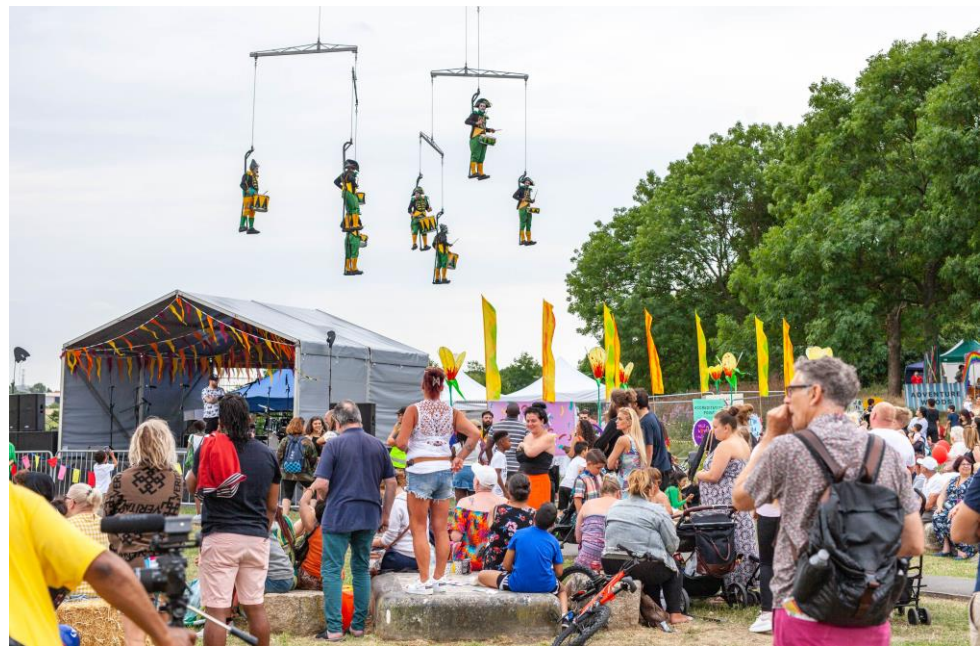
Thamesmead Festival 2017, 2018 & 2019