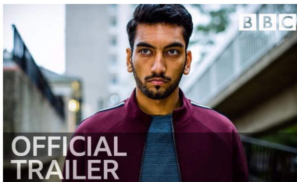
Informer, BBC Drama, Oct 2017 – Jan 2018