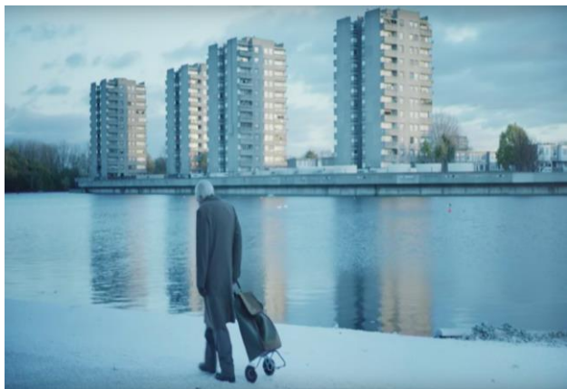
Age UK advert, December 2017