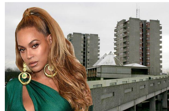
Beyonce music video, Oct 2019