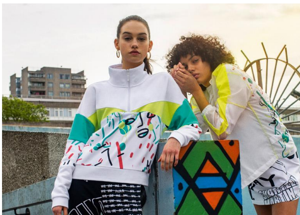
Puma advert, August 2018